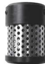
Optional Weatherguard (may not be suitable for use with absorbent gases)

Versions available for the detection of:-